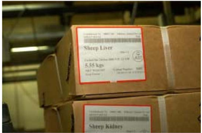
The printed carton labels comply with the GS1 Standards and the guidelines for numbering and bar coding meat products.